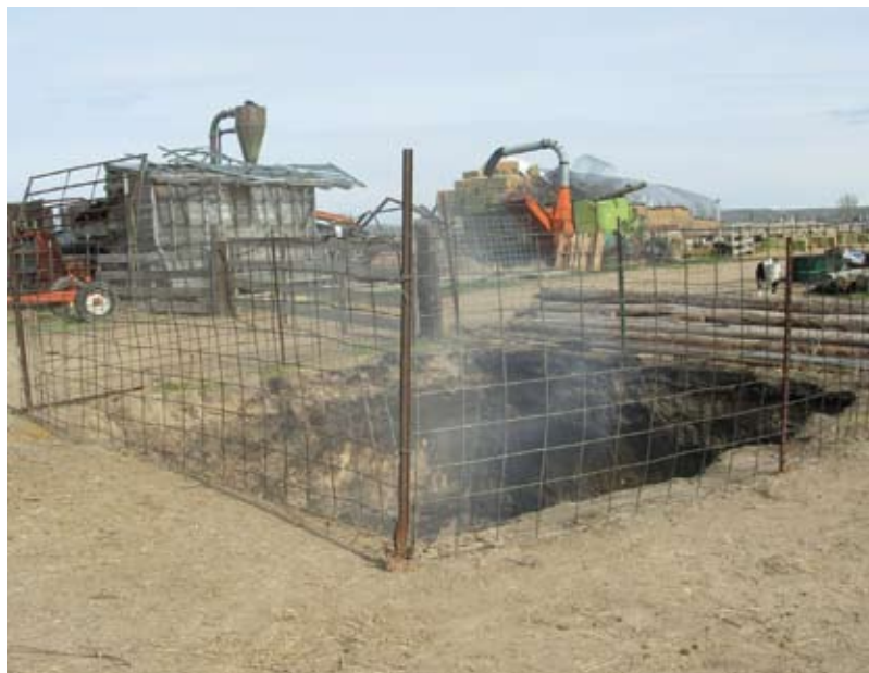
Fencing around a deep carcass pit is an added barrier to wolves and other scavenging predators drawn to the area.