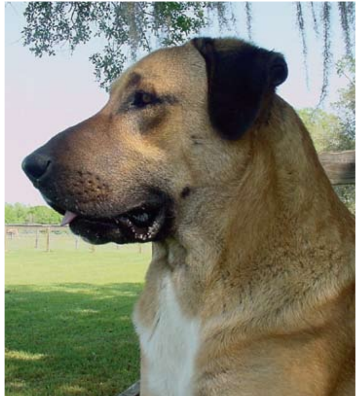
The Anatolian shepherd is one of several breeds developed to guard livestock.