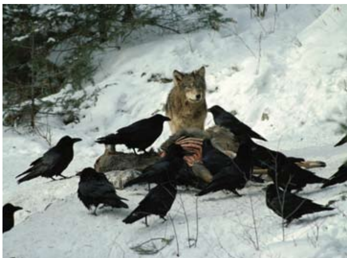
A wolf shares a deer carcass with a flock of ravens in Minnesota. Scavengers as well as predators, wolves are strongly attracted by dead animals.

Hauling away, burying or burning livestock carcasses rather than leaving them in the field to rot reduces the chances of attracting predators. It also limits the food supply in the area, which can result in a lower number of predators in general. Once a wolf becomes used to a food source, such as dead livestock lying on the ground or in an open pit, it is more difficult to stop it from returning to look for an easy meal. Thus, preventing the attraction in the first place is important.