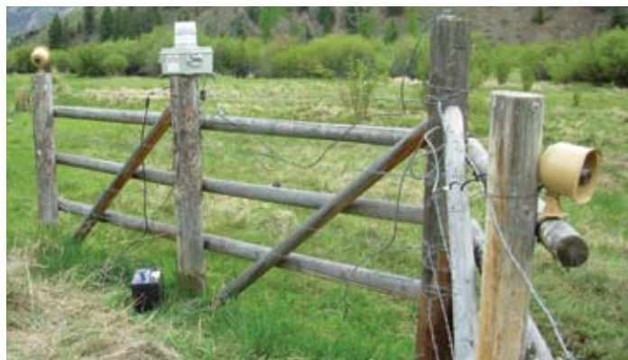
The radio-activated guard system—RAG box for short—affixed to this fence consists of loudspeakers and a battery-powered computer housed in a metal box.

RAG boxes consist of a receiver, a bright strobe light, two loudspeakers and an internal computer that collects and stores information received from transmitters on wolves' radio collars. You attach the RAG box to a fence line or place nearby and set it to go off with sound and light whenever it picks up a signal from a radio