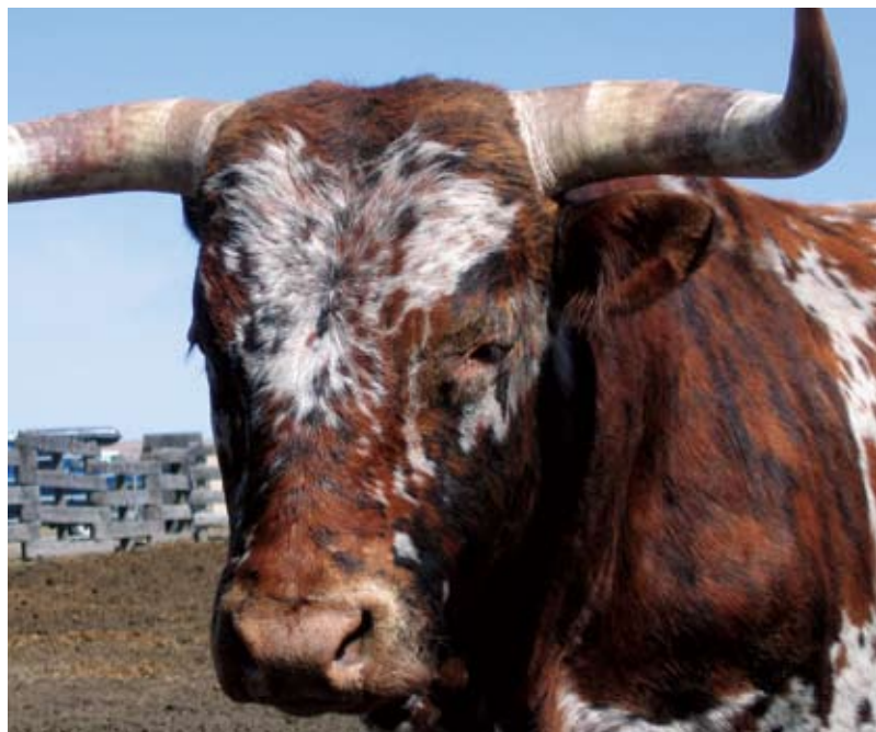
A longhorn steer will charge at wolves and other predators when they approach.