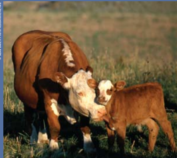
Cow-calf pairs may fare better against predators in some regions; in others, grazing yearlings keeps losses down.