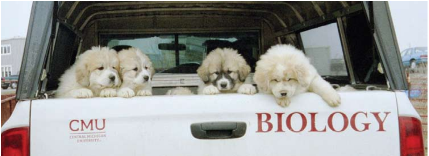
Great Pyrenees pups are ready for transport to farms in the Great Lakes region where researchers will monitor their effectiveness at protecting livestock from predators.

to defend their young offspring and den sites by seeking out and killing the dogs.