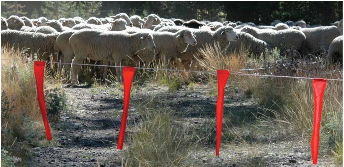
Fladry—red flags hung at 18-inch intervals along a thin rope—is an inexpensive, portable and effective method of keeping wolves away even in open range.