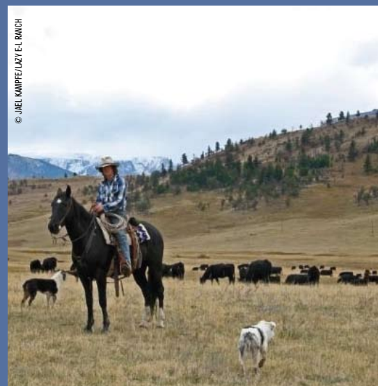
A range rider monitors a herd in Montana.