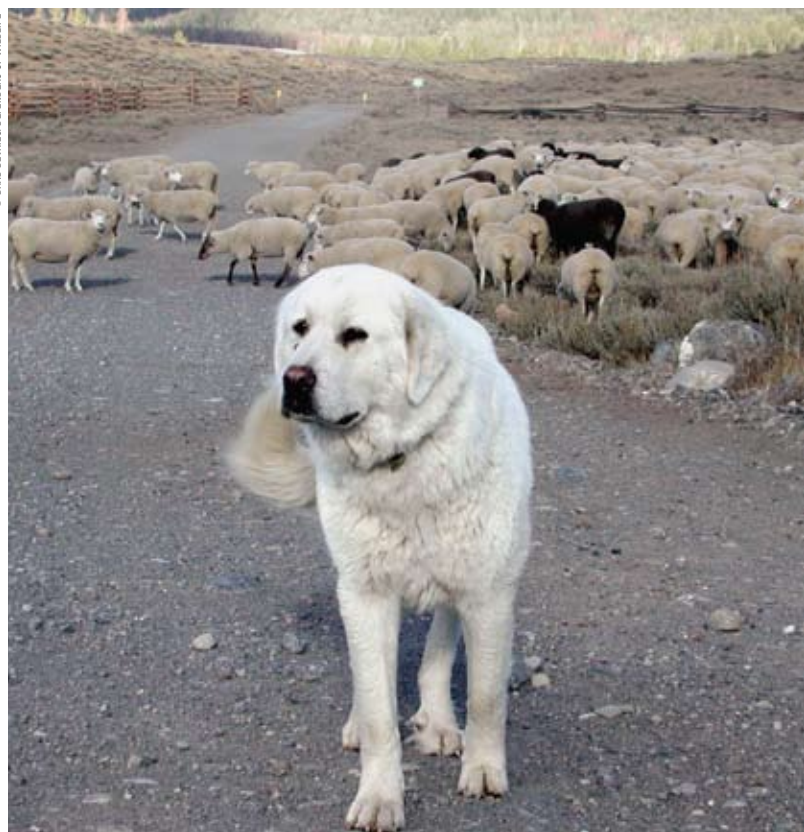
A Great Pyrenees stands guard on an Idaho sheep ranch.